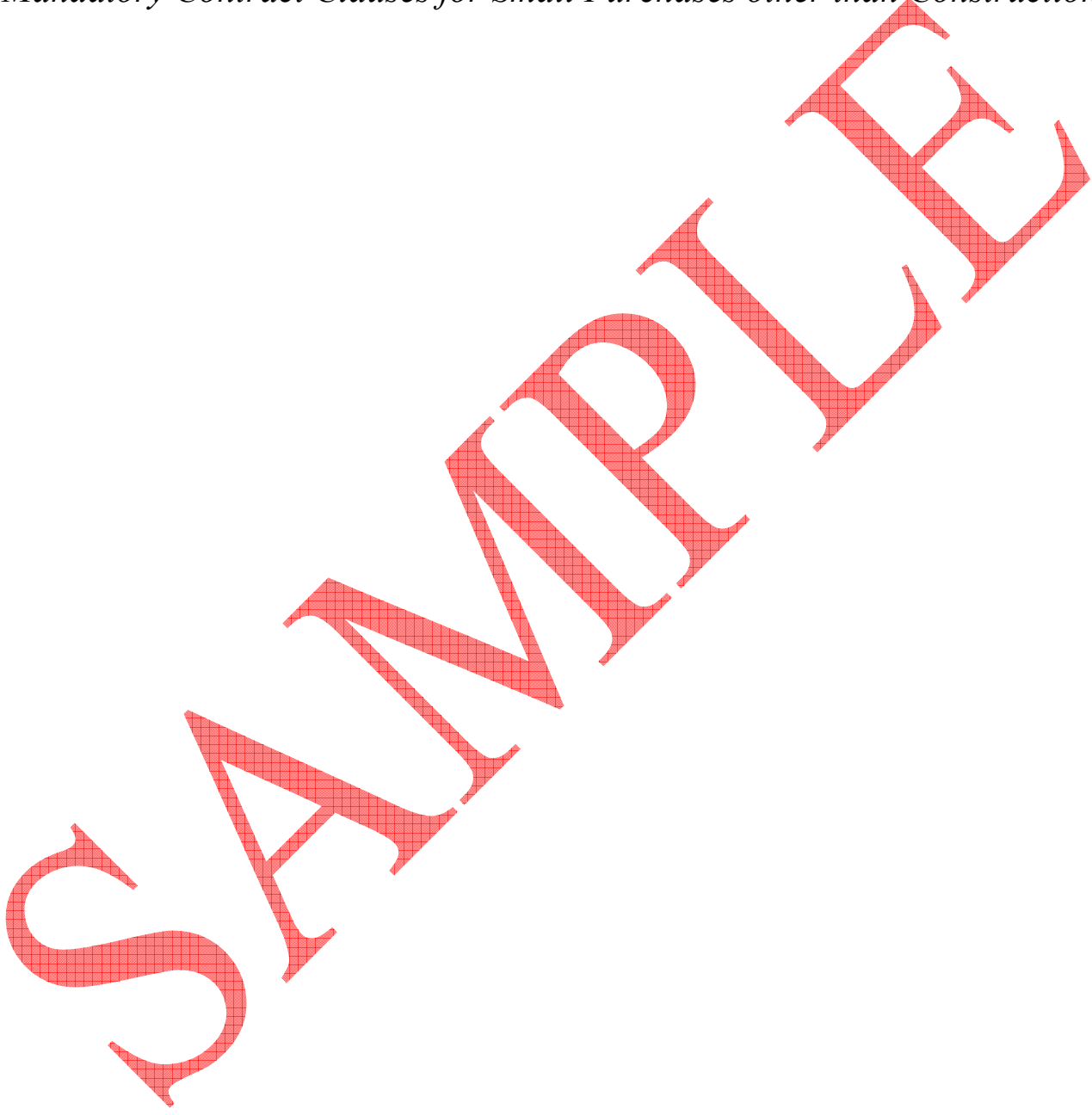
Table 5.1 of HUD Procurement Handbook 7460.8 REV 2 Mandatory Contract Clauses for Small Purchases other than Construction